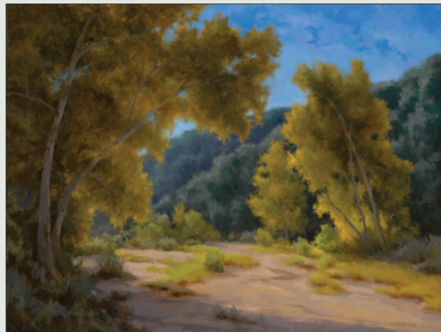
"Sycamores Graceful and Glowing"

We look forward to seeing you May 3rd and 4th!