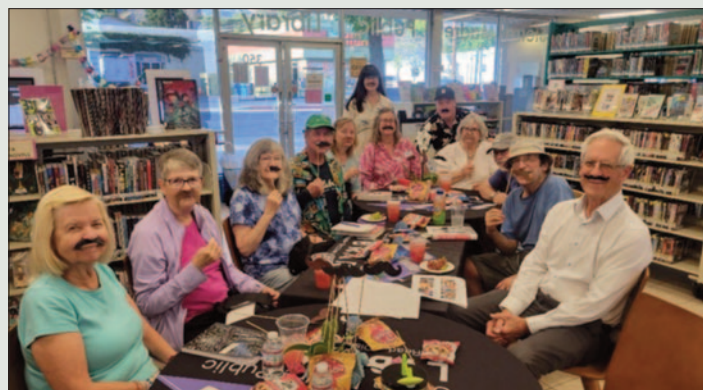
Shelf Stories Book Club – You Never Know by Tom Selleck

Finally, the Library cannot express how much we appreciate the collaboration and engagement from our community. Thank you for a wonderful summer!