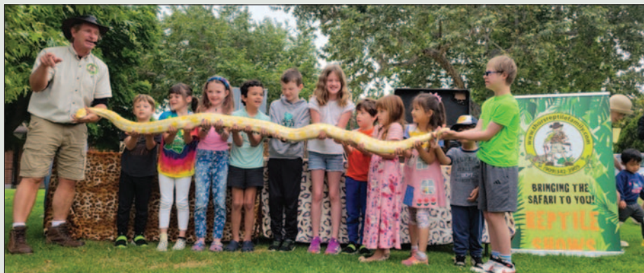
Summer Reading Kickoff! — Thor's Reptiles