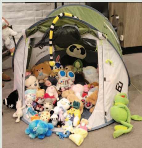
Stuffed Animal Sleepover at the Library

This past summer was a delightful mix of ingenuity and creativity that drove our Library to provide fun and educational opportunities for our community. We had a total of 68 programs in June and July, with 2,387 participants . Our Summer Reading Program was a smashing success again this year with 405 people eager to read this summer. In addition to reading, we asked the community to support local businesses, nonprofits, community events, and parks with our Operation Support Sierra Madre Local and 129 participants did just that. Our teens were active this summer as well with 36 teen volunteers who worked a total of 524 hours to sign people up for summer reading, distribute prizes, help with programs, and be reading buddies!